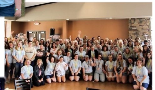
Over 100 volunteers!!

We are blessed to be a part of this ministry every year to help those who need encouragement and hope.